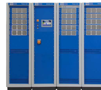
Amplifier (Illustration similar)