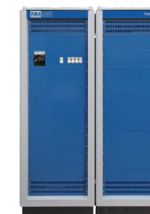
Field power supply