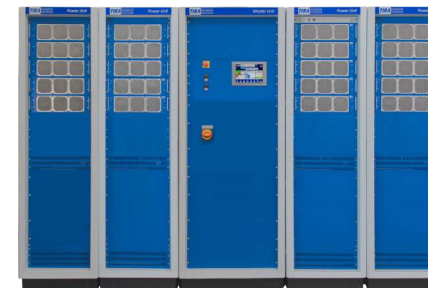
Amplifier (Illustration similar)