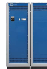
Field power supply