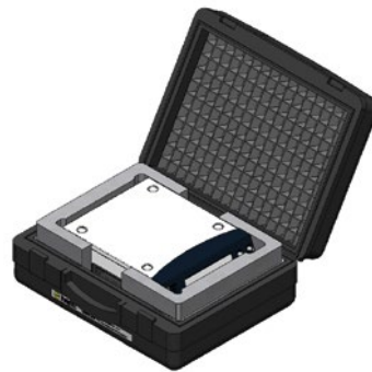
VIB-A-CAS12 Transportation Case